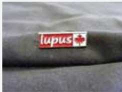
Lupus Logo Lapel Pin