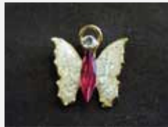
Angel of Hope Lapel Pin