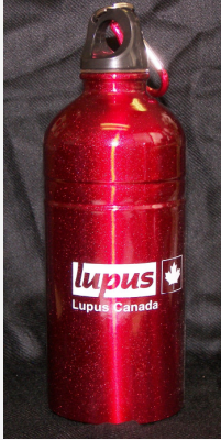
18 oz Stainless Steel Water Bottle