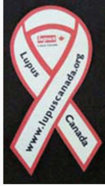
Lupus Ribbon Magnet